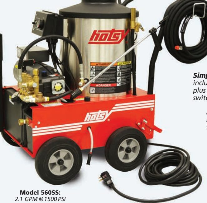
Solid flat free tires

Adjustable, spray-angle nozzle with 0° to 80° spray patterns adjusts easily under high pressure