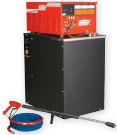
HWE Series Hot Water Electric Pressure Washer