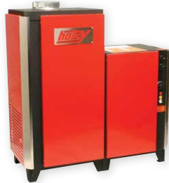
900 Series Hot Water Electric Pressure Washers