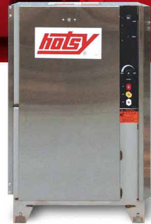
CWC Series Cold Water Electric Pressure Washers (Optional Stainless Steel)