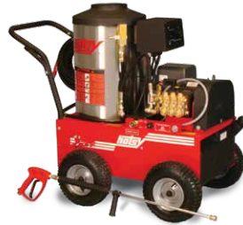
895SS Hot Water Electric Pressure Washer